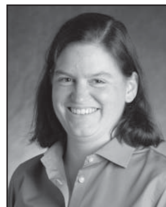
Amy Hughes Sports Information